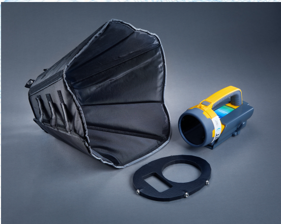
Bactiscan™ shown with optional shroud

While other technologies, such as fluorescent markers and gels, are available, they are not environmentally friendly and, like ATP tests, suffer from the limitations of a small testing area, making accurate results difficult to obtain.